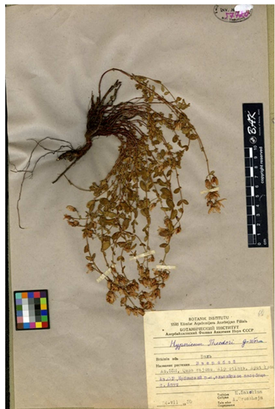
Figure 1. H. theodorii Woronov.